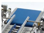
In-feed and out-feed conveyors