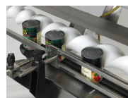
Helix product handling system