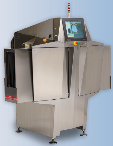
Thermo Scientific Xpert S400 X-Ray Inspection System