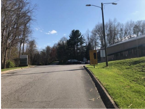
Driving up the hill from Sweeten Creek Close up of sign showing traffic pattern