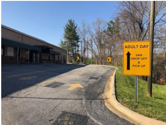
Going around to the side of building