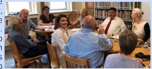
Working Committee Meeting