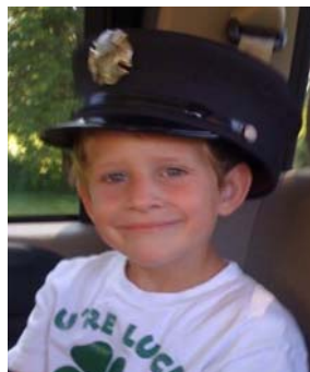
O'Malley Scholarship Recipient (photo taken 2006)