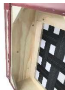
Slide base over the three threaded rods in the arm