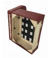
Add the washers and knobs then tighten knobs