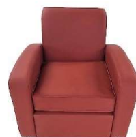
Add the cushion