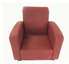
Roll over into