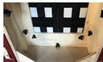
Add the washers and knobs and tighten knobs