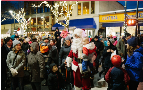
Holiday Parade and Tree Lighting