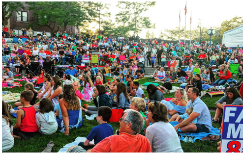
Main Street Monday during Venetian Festival