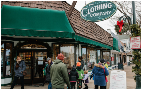
Merchant Open House & Hot Cocoa Contest