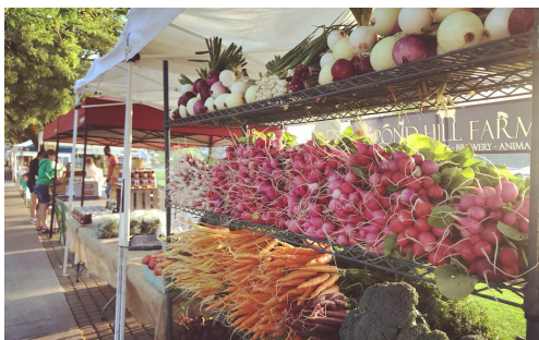
Charlevoix Farmers Market