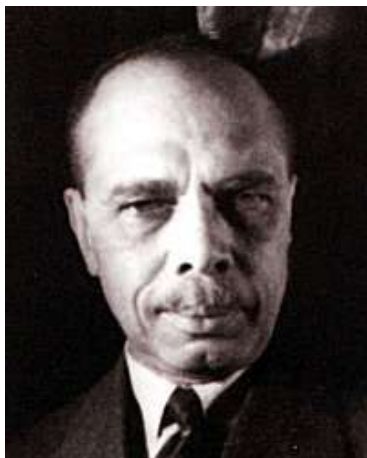
James W. Johnson 1871-1938

James Weldon Johnson went on to become United States Consul to Venezuela in 1906 and to Nicaragua in 1909. In 1913, he became the editor of the New York Age. He was also very active in the NAACP. Other writings of Johnson include God's Trombones: Seven Negro Sermons in Verse in 1927. Black Manhattan in 1930, and Negro Spirituals in 1925. Johnson died in 1938. The United States Postal Service issued a 22 cents commemorative stamp (the eleventh in the Black Heritage Series) in his honor in 1988.