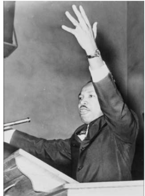
Martin Luther King, Jr., at a freedom rally, Washington Temple Church, 1962

"We've got some difficult days ahead. But it doesn't really matter with me now. Because I've been to the mountaintop. I don't mind. Like anybody, I would like to live a long life; longevity has its place. But I'm not concerned about that now. I just want to do God's will. And He's allowed me to go up to the mountain. And I've looked over. And I've seen the Promised Land. I may not get there with you. But I want you to know tonight, that we, as a people, will get to the Promised Land. So I'm happy, tonight. I'm not worried about anything. I'm not fearing any man. Mine eyes have seen the glory of the coming of the Lord."