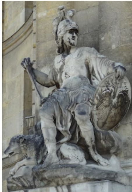
Statue of Mars, Hotel National des Invalides, Paris

And so, the myth of redemptive violence makes it hard