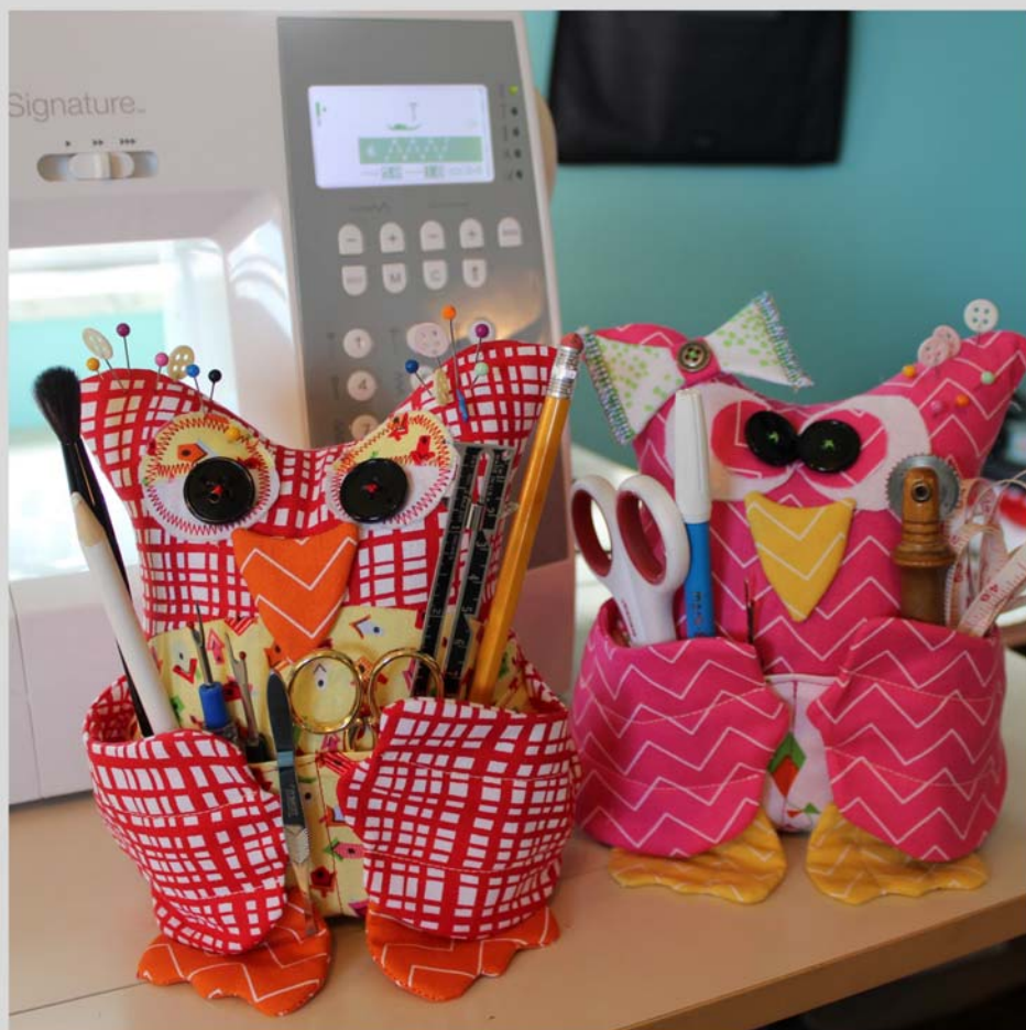
The “Owl You Need” Sewing Buddy shanniloves.blogspot.com