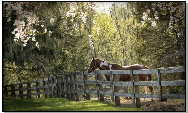
2nd Place - Fenced In - Susan Fielder