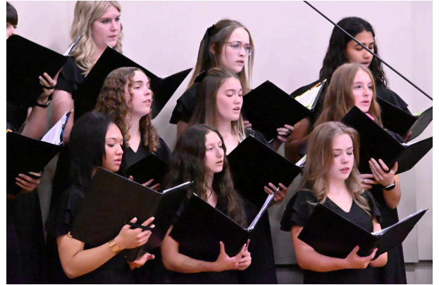
Shoreland Chamber Choir

Part of the training that goes into meeting these standards starts at the annual Shoreland Music Festival. This year, 250 musicians will come prepared to perform their solos in front of judges and a room full of friends and family. Musicians will range from elementary to high school age, and from near beginners to seasoned veterans. If you are looking for a fun day of music and fun, come out to the Shoreland campus on Saturday, March 1 from 9:00 to 3:00.