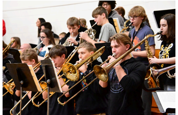
Shoreland Pep Band