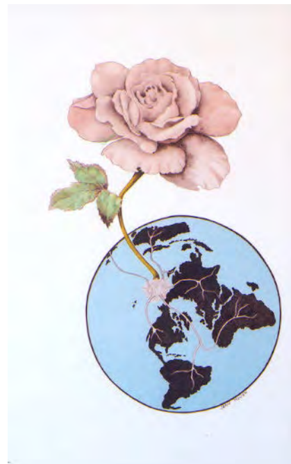
Graphic art created in 1985 from my vision of how we, like roses, are connected to mother earth. mar