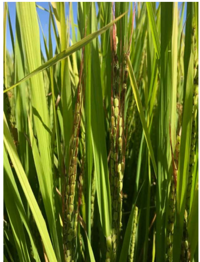
Figure 2. Immature panicle of weedy rice Type 6 in the field. The long reddish awns are clearly visible before maturity.