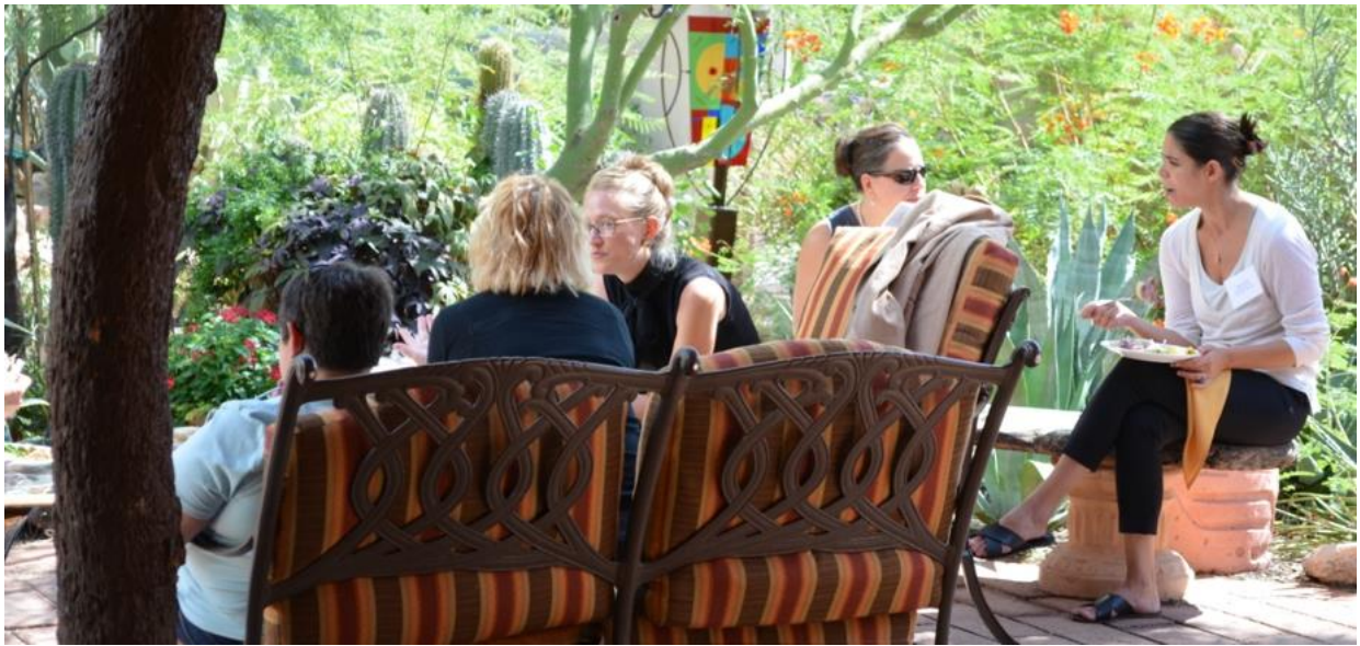
Scholars at our 3rd Annual Research in Convening in September

In September, we held our third biennial research convening. This was our largest convening yet – over fifty scholars joined us in Tucson for a three-day event featuring new research on topics such as civility in US politics, civility and social media, and new computerized techniques for analyzing speech.