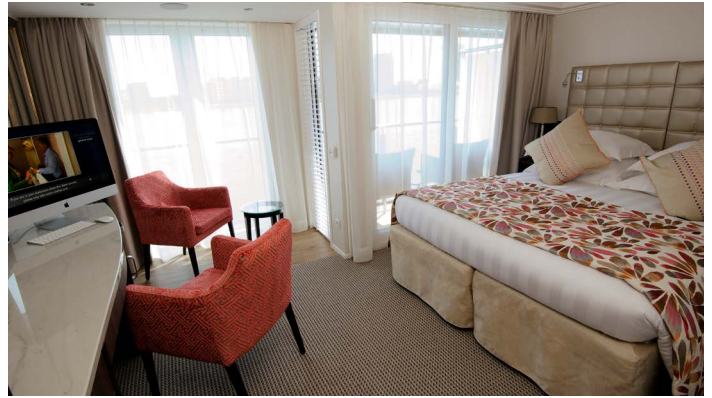
Twin Balcony Stateroom