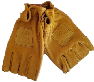
Top – back of hand “Elks Thank Veterans”