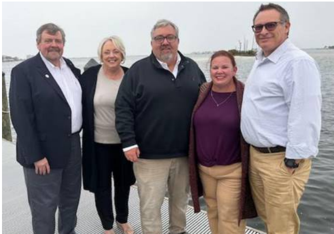
Elks Lodge 1648 enjoy lunch at Sunset Grille in Perdido Key, FL.