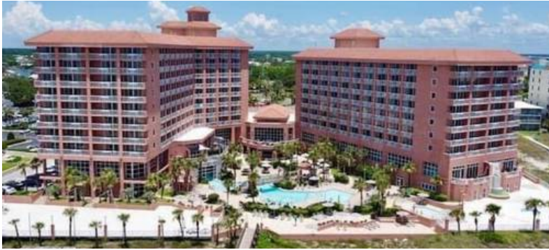
Alabama Elks Mid-Year Conference January 17-19, 2025 Perdido Beach Resort Orange Beach, AL