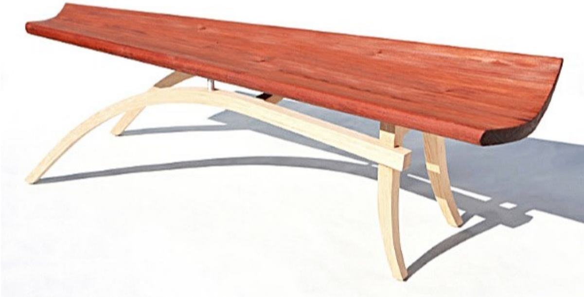
Entry Bench. Unfinished white oak with tapered bent laminations and coopered redwood seat constructed of redwood reclaimed from the ceiling of Moffat Field Air Force Base. 21”d x 42”w x 18”h.

1Q: What was your last career, how long did you do it, and when did you retire?