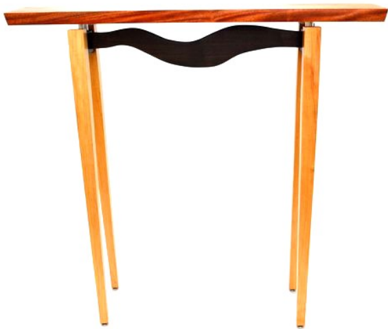
Above left: Hall Table . African mahogany , eb- onized walnut, maple., with aluminum posts. 11"d x 32"w x 34"h.