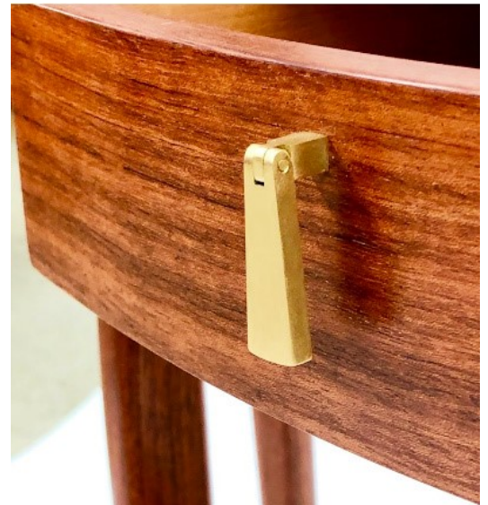
Above left: Demilune Sunrise , quilted maple, bubinga, and handmade brass pull. 13”dx 35”w x 33”h Above right: Demilune Sunrise detail of brass pull.

8Q: How do you go about designing a piece?