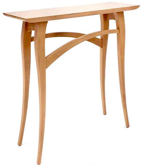
Above right: Asymmetrical Movement . Ma- drone entry table . 12"dx 34"w x 34"h.

5Q: How is this different from a passion experiment?