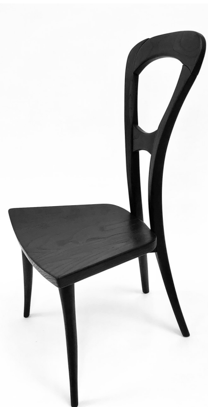
Black Beauty , ebonized elm bentwood chair. 18"d x 18"w x 36"h. Tied for Best of Furniture award with Beauty 360 (below) at Sonoma County Museum of Art's 2018 Artistry in Wood exhibit.