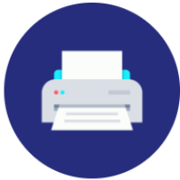
Printer & Paper