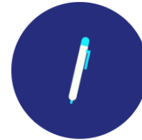
A blue pen

*Need help acquiring any of the materials? Contact us at RJC_GetOutTheVote@uucsw.org