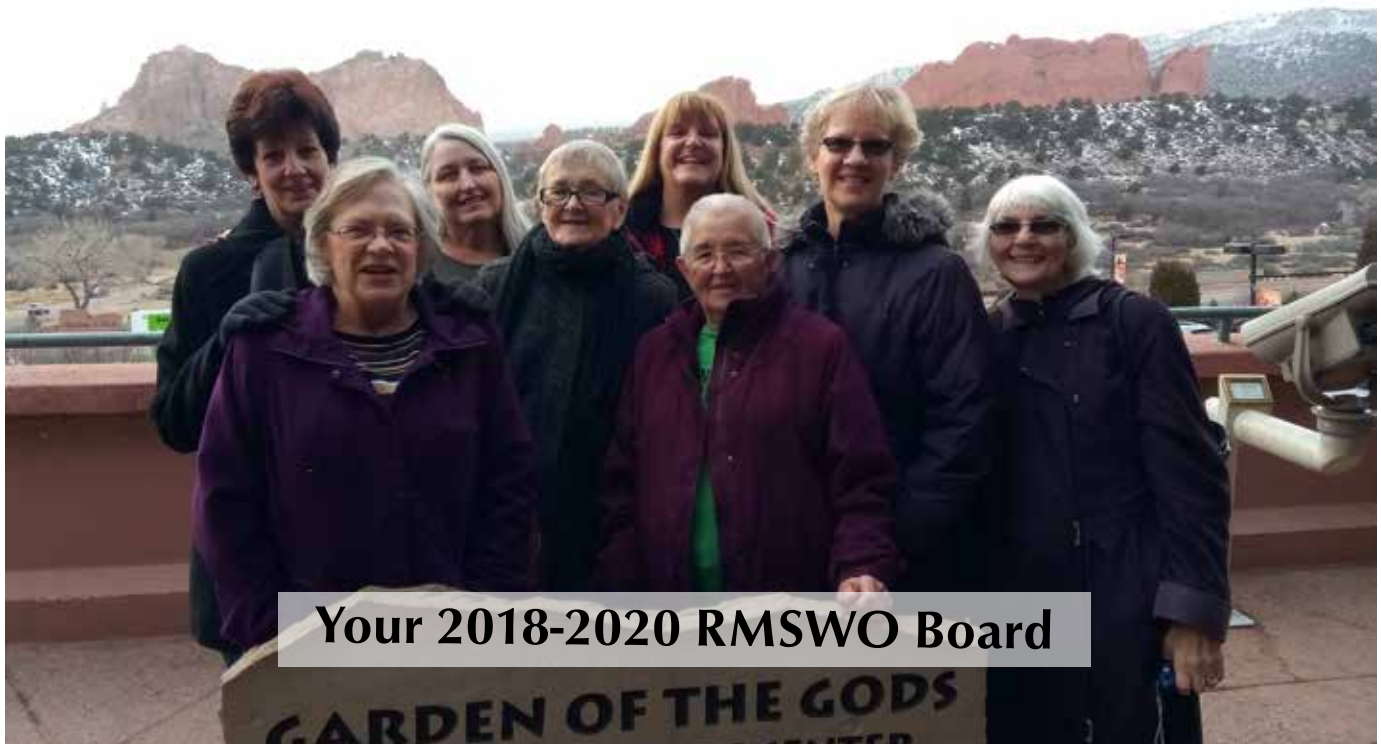
Your 2018-2020 RMSWO Board