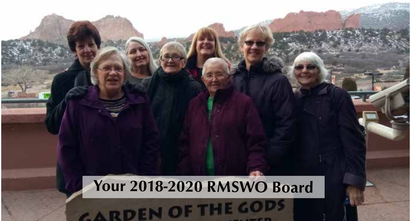
Your 2018-2020 RMSWO Board