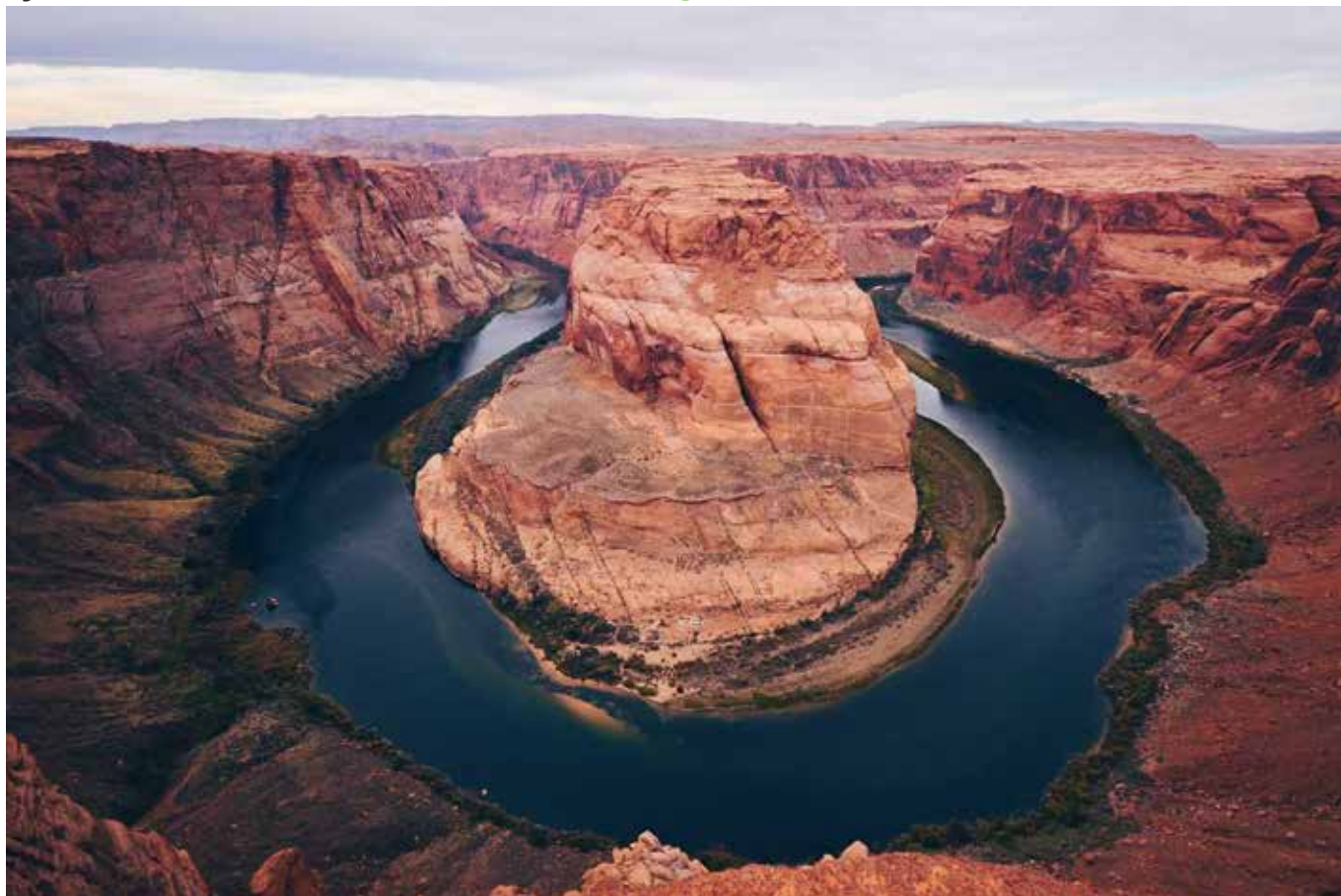
Horseshoe Bend

by Women of the ELCA , 1.29.2020; Gathering 2020 , News