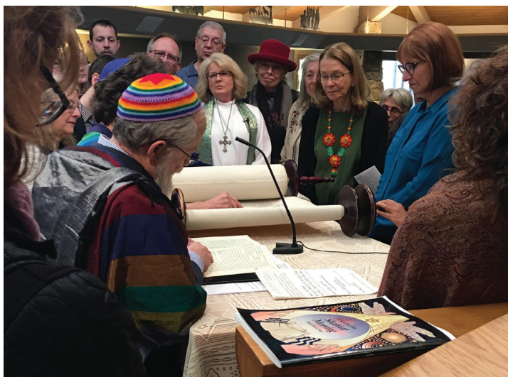
The community gathered around the altar as the rabbi read from the Torah.

Our shared sanctuary, with its warm design of natural light and the mixed metals of the Shekinah Glory and Dove of Peace reflected in the credence table, invited such a venture. The sound of running water descending from cupped leaf to cupped leaf of the baptismal font calls forth peace and new life. Ironically, the rich designs of these sacred elements had come through the vision of a Boulder artist and Jewish designer nearly two decades before. One can only wonder if they had also envisioned that their shared artistic expression would ultimately weave together the rich traditions of an established Lutheran congregation and a budding Jewish Renewal community.