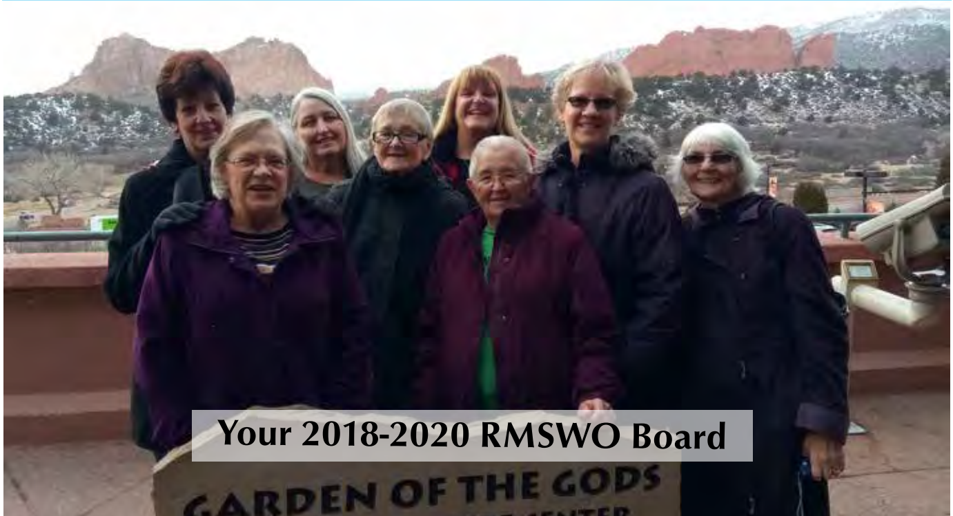
Your 2018-2020 RMSWO Board