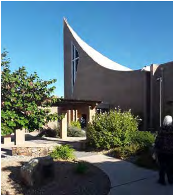
St. Paul Lutheran Church