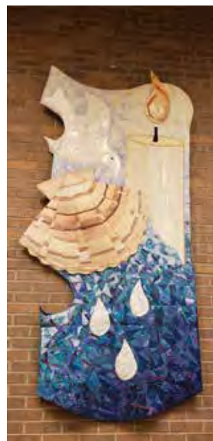
Baptismal quilt hanging at St. Paul.