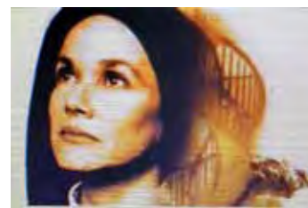
Actress Barbara Hershey

thetic nun and William Peterson of TV's "CSI" is the mysterious carpenter who volunteers to build a spiral staircase after the original builders forgot to provide access to the chapel's choir loft.