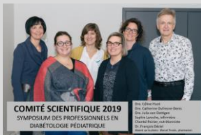
COMITÉ SCIENTIFIQUE 2019 SYMPOSIUM DES PROFESSIONNELS EN DIABÉTOLOGIE PÉDIATRIQUE

Almost 150 people from across the province proudly wore blue clothes as a solidarity gesture towards people living with diabetes for the 8 th edition of the symposium which was held on November 14 - World Diabetes Day.