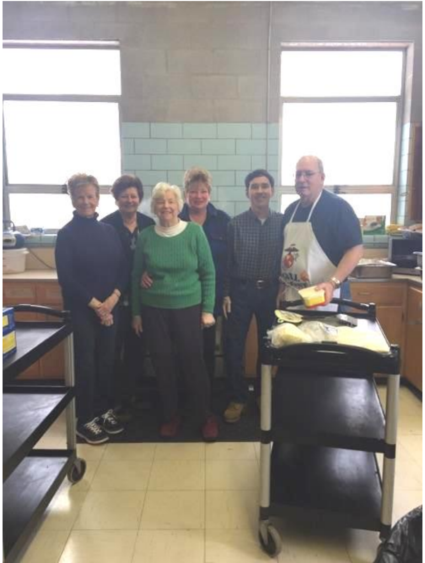
St. John's at the Open Door Soup Kitchen

Saint John's The Episcopal Church in Pine Meadow, CT