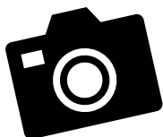
PHOTO CONTEST Post a unique and FUN photo of yourself with one of our exhibitors using our BEACH SCENE Step & Repeat to the WALL (must mention the Exhibitor's company in your post). Five winners chosen daily Monday & Tuesday will receive another drink ticket for Tuesday evening's event!