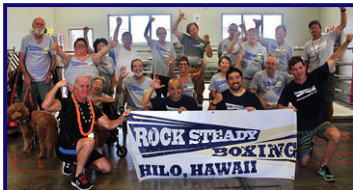
Rock Steady Boxing with Aloha in Hilo

uplifting effect everywhere that he by sharing his message of "Fighting Parkinson disease with everything you've got."