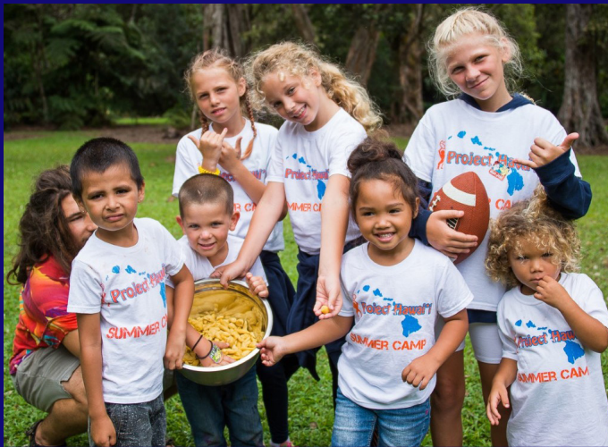
Project Hawai'i Keiki Having Fun!

Project Hawai'i, Inc. is a nonprofit organization run 100% by volunteers and solely supported by public donations. Our mission is to enhance the lives of homeless keiki and help them escape their cycle of poverty. We are gearing up for our summer educational programs that we offer free of charge to homeless children of all ages. We have several different options to help make this a successful event for these precious children. Our program has several different aspects: from our teen mentoring program, junior leader program, and our sleepover for the younger children. We encourage volunteers to host fundraising and collection sites prior to camp; host a teen mentoring or leadership program, or teen cultural program; or provide general help at our sleepover camp. Another option is to provide meals or snacks for our keiki at camp. This can be done as a drive, fundraiser, or your