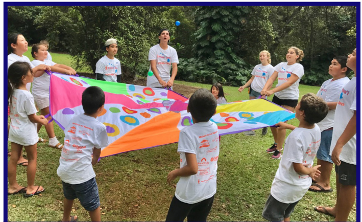
Keiki and Staff Blanket Toss!

group making meals. Also, we seek volunteers to host a collection for back to school supplies, new outfits, and shoes. This can be done at your chosen location and time you set. We will be giving away more than 150 new backpacks. Please visit our website at ProjectHawaiiSummerCamp.org or email us at ProjectHawaiiSummerCamp@HelptheHomelessKeiki.org for more information and details. Mahalo.