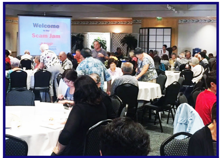
AARP Hawai'i Scam Jam Audience

AARP has set up the Fraud Watch Network to alert you about the latest scams in your area. You can call our free helpline at 1-877-908-3360 to report scams or for advice if you or a loved one suspect a scam. You can also go online to aarp.org/fraudwatchnetwork to get tips on fighting fraud, see our interactive map of frauds reported near you, and sign up for free ‘Watchdog Alert’ emails.