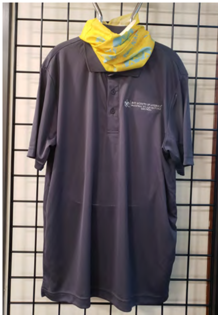
MEN'S DARK GREY POLO $25.00