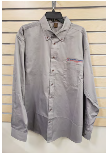
MEN'S GREY LONG SLEEVE $30.00