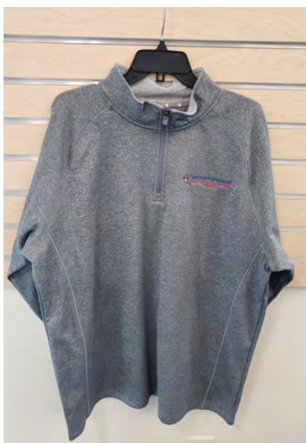
MEN'S GREY HALF-ZIP SWEATSHIRT $40.00