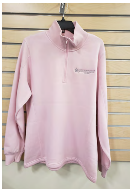
WOMEN'S PINK HALF-ZIP SWEATSHIRT $30.00