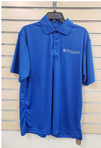
MEN'S ROYAL BLUE POLO $25.00