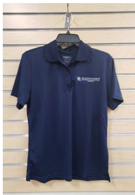
WOMEN'S NAVY POLO $20.00