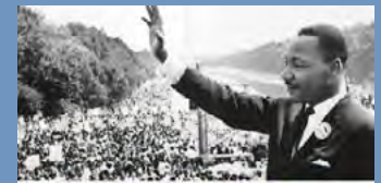
Martin Luther King Jr. Day

*Check with your local Scout Shop for more information, not all Scout Shops do hemming.