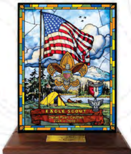
Eagle Scout® Tableau with Name 625333 - $169.99