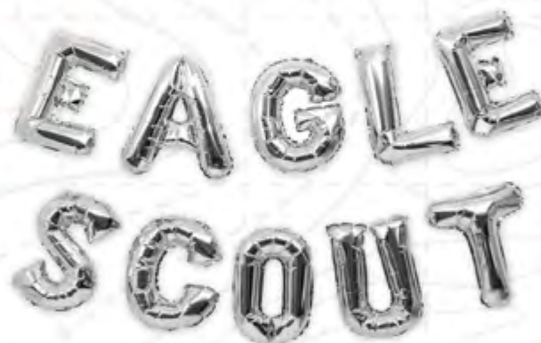
Eagle Scout® Balloon Banner, Silver 660518 - $9.99