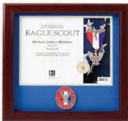
Eagle Scout® Certificate Frame, 12"x12" 22014 - $74.99