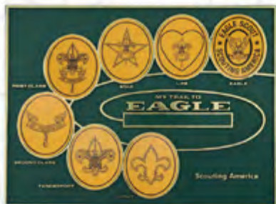
My Trail to Eagle Plaque 662960 - $24.99

Honor their achievement with a gift that celebrates dedication and excellence.