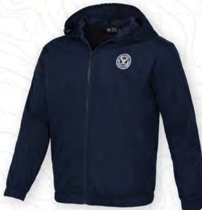
Eagle Scout® Windbreaker Jacket, Navy 660482-86 - $29.99