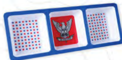
Eagle Scout® 3 Bowl Chip and Dip Tray 661119 - $12.99