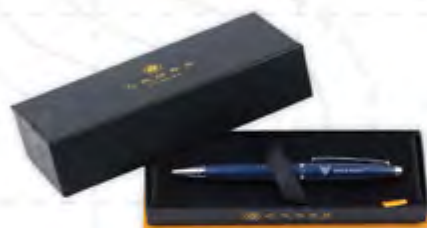
Cross Eagle Scout® Ballpoint Pen with Gift Box 661038 - $39.99