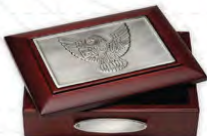
Mahogany Keepsake Box With Eagle 14029 - $69.99