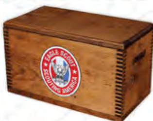
Eagle Scout® Memory Box 663955 - $39.99