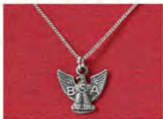
BSA Eagle Necklace 2551 - $8.99