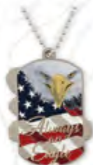
Eagle Scout® Dog Tag 664084 - $12.99