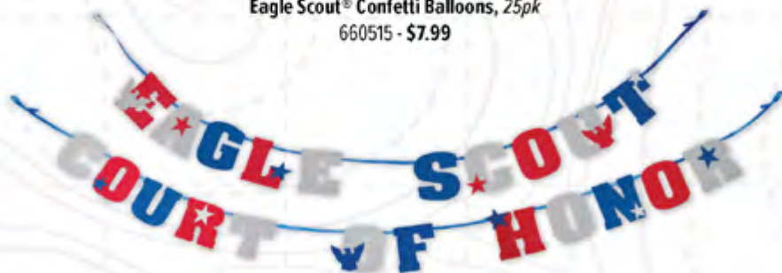
Eagle Scout® Court of Honor Felt Banner 629253 - $6.99