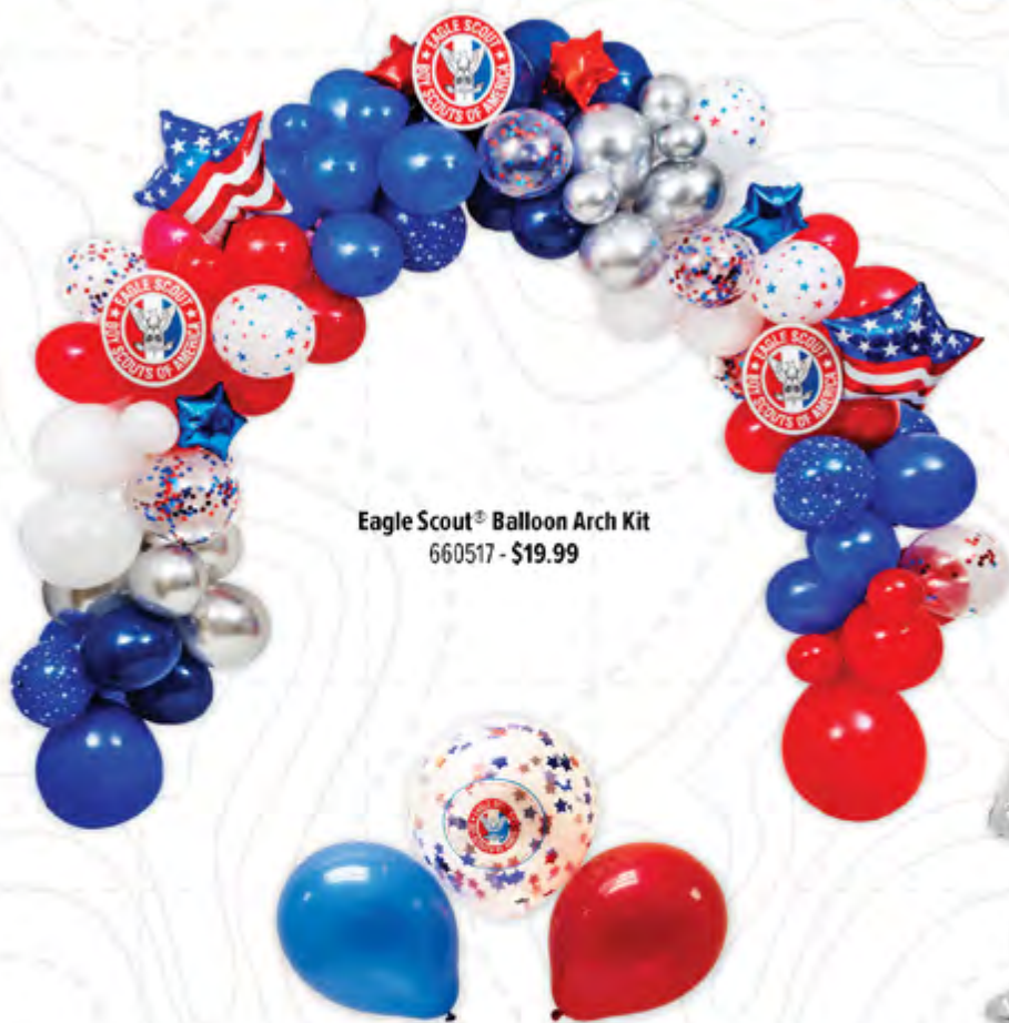
Eagle Scout® Balloon Arch Kit 660517 - $19.99

Plan a Court of Honor Worthy of Scouting's Highest Rank—Complete with Exclusive Party Gifts!