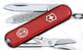
Eagle Scout® Swiss Army Classic SD 619627 - $27.99