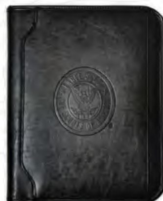
Eagle Scout® Padfolio 657018 - $69.99