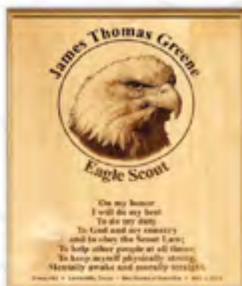
Eagle Scout® Laser Plaque 17432 - $59.99