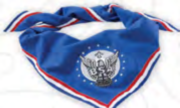
Eagle Scout® Embroidered Neckerchief 64079 - $16.99