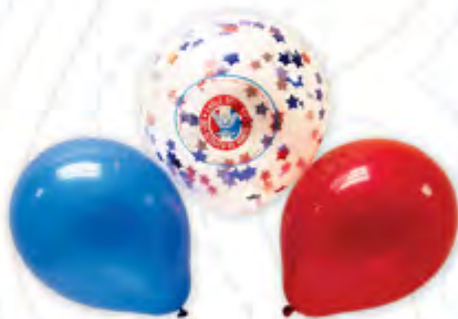
Eagle Scout® Confetti Balloons, 25pk 660515 - $7.99