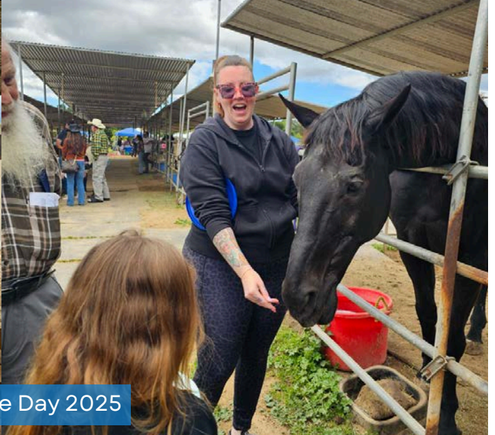
Help a Horse Day 2025