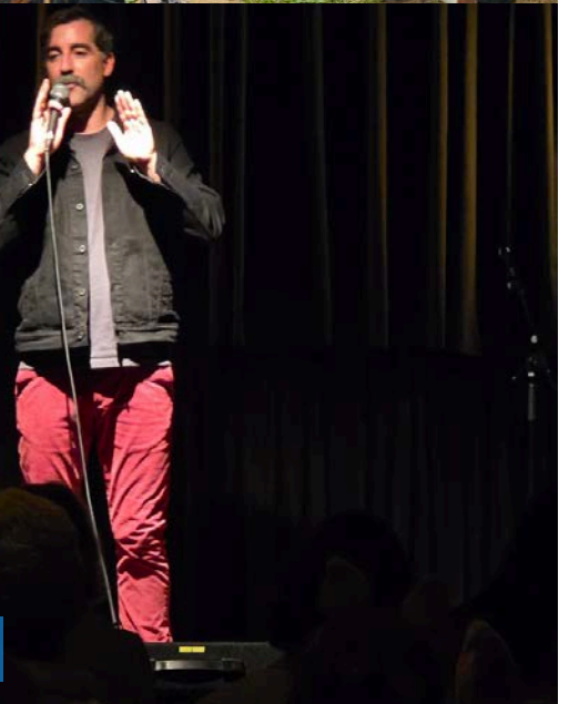
A Night of Comedy 2025

Thank you for celebrating 25 years of rescue, rehabilitation, and refuge with us!