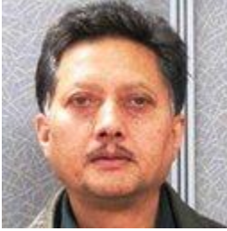
Veer Khar Auckland, New Zealand

NRI Limit is too low. Deposit only at RBI only is not practical. Procedure must be simple, easy and fast for NRIs with or without Indian passport.