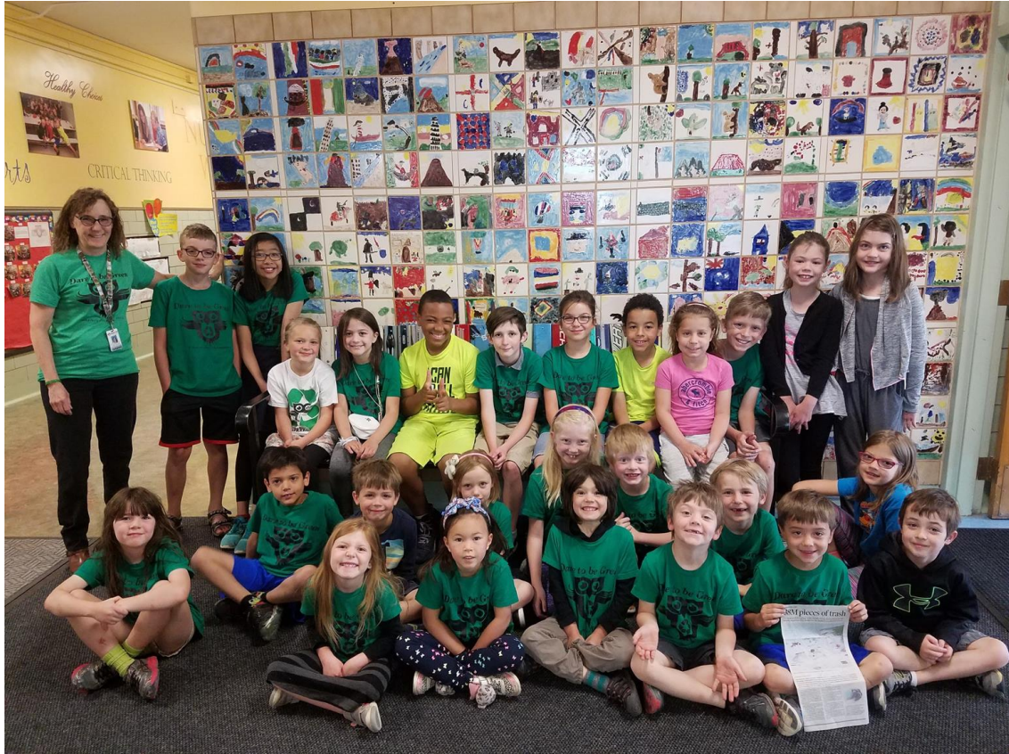
Photo: 2016-17 Student Green Team