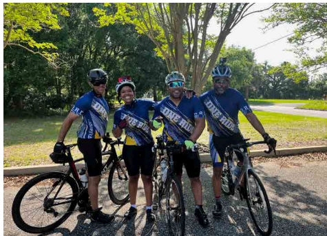
ONE RIDE SPORTING THEIR NEW KITS!