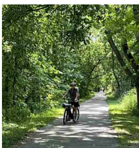
FRED MEIJER WHITE PINE TRAIL STATE PARK

Beginning near the stadium for the West Michigan Whitecaps Minor League Baseball team just north of Grand Rapids, you'll head north 28 miles through mostly rural terrain. After passing through Cedar Springs, Sand Lake, Pierson, and Howard City, the pavement ends about 19 miles past Rockford.