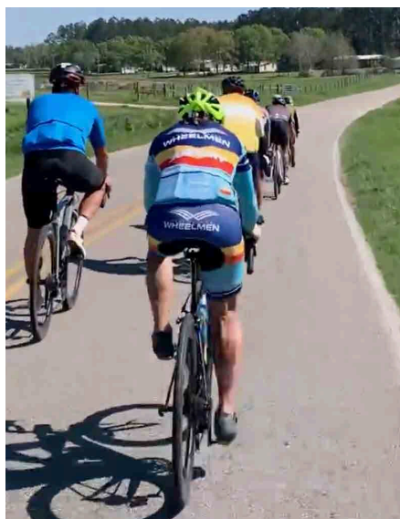
RIDING TO THE MIGHTY A!