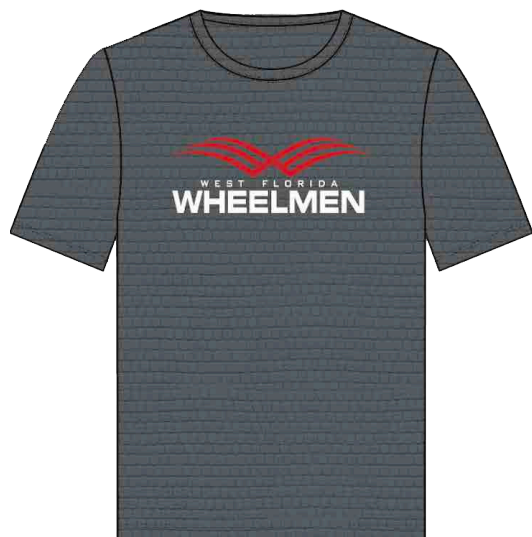
NEW TECH SHIRTS. SHOULD ARRIVE BY APRIL 26. $15