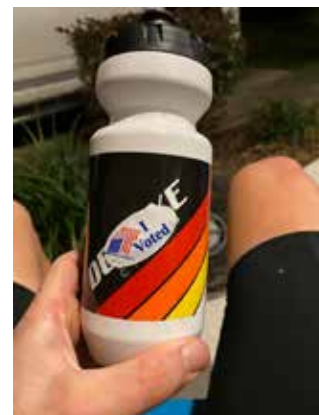
RECOUNT! HOW DID THEY ALLOW IAN'S WATERBOTTLE TO VOTE?!