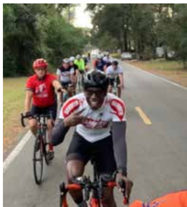
TROY AND THE GANG RIDING TO HURST HAMMOCK.