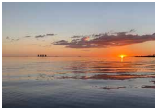
JEFF BOULTON CAPTURED THIS SUNSET.