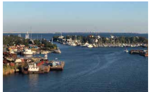
THIS IS WHY YOU SHOULD DO THE SUNDAY RIDE IN THE CITY.