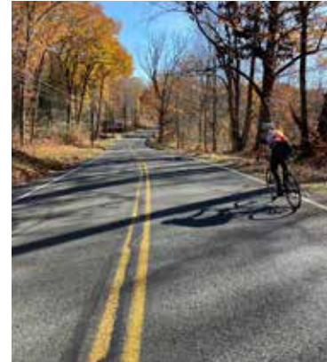
EMILY KOPAS TOOK THIS PHOTO WHILE RIDING CONNECTICUT.