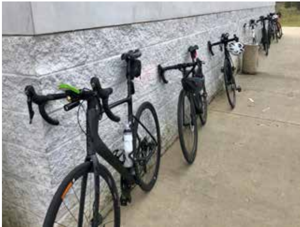
FORMAL BLACK TIE AFFAIR.