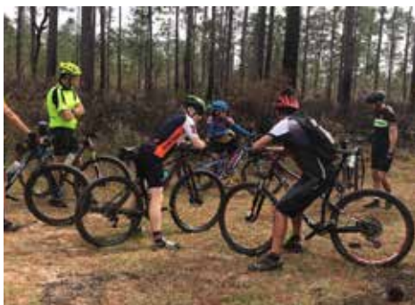
SPEED KILLS, PLAY IT SAFE, BUY A HUFFY.