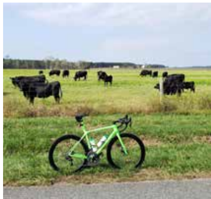
DEREK WHITE'S BIKE ROUNDING UP THE DOGIES.