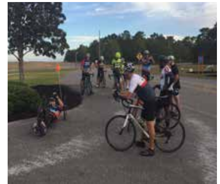
THE THIRST FOR HURST.