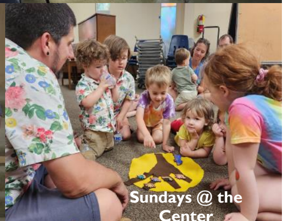
Sundays @ the Center