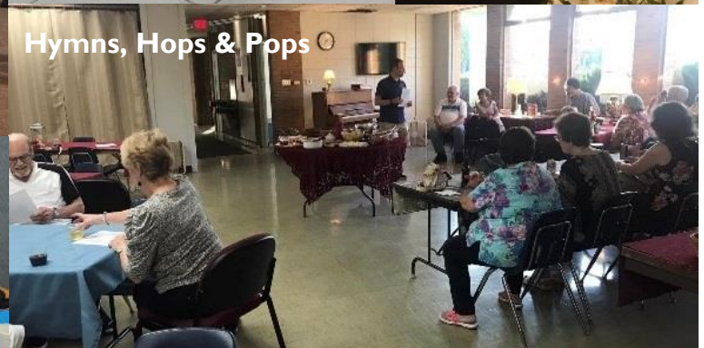
Hymns, Hops & Pops