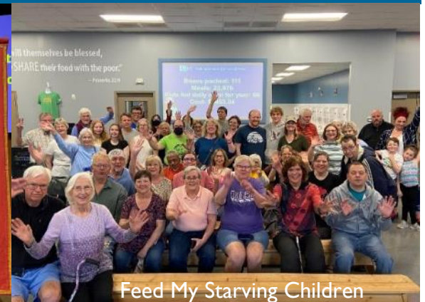
Feed My Starving Children