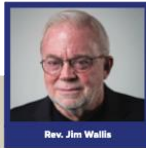
Rev. Jim Wallis

Thursday, October 24, 6:30p.m. Woodmont Hills Church 3710 Franklin Pike, Nashville