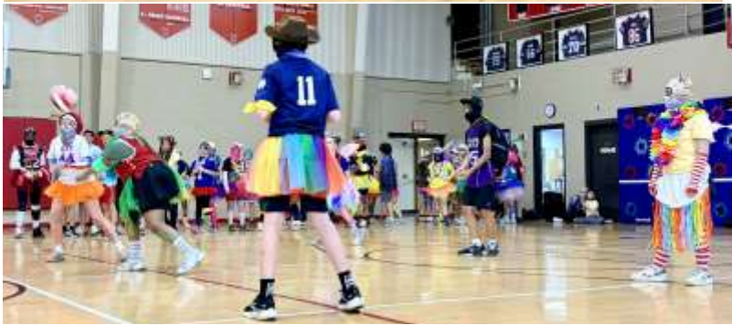
Our annual 7th grade vs. Staff Kickball game turned into a Volleyball game due to the rainy day. Our staff won again!