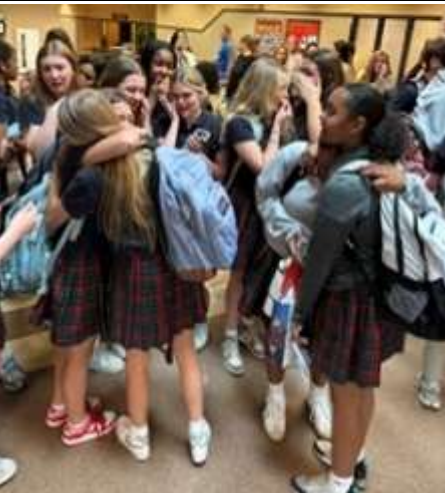
Yesterday was our 8th graders' last day! We wish them well as they move on to high school and know they will do great things!