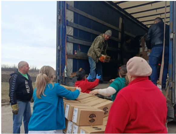
From Valkivska to Berestynska, these supplies are helping doctors and nurses continue their lifesaving work under extraordinary circumstances.