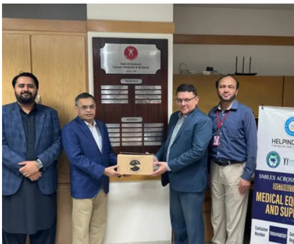
This is the power of partnership in action, turning shared commitment into meaningful, life-changing impact across borders.