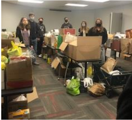
United Way Thanksgiving Food Drive