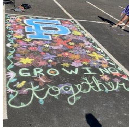
Class of 2022