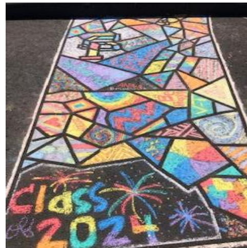
Class of 2024

The Virtual Club Fair will be on Wednesday, September 23 from 7:00 pm – 8:00 pm. Come explore all the different club opportunities we have at St. Paul for the 2020-2021 school year. Advisors will be available to give an overview of each club as well as answer questions. A Zoom invitation will be emailed to students on Monday for this event. See you there!