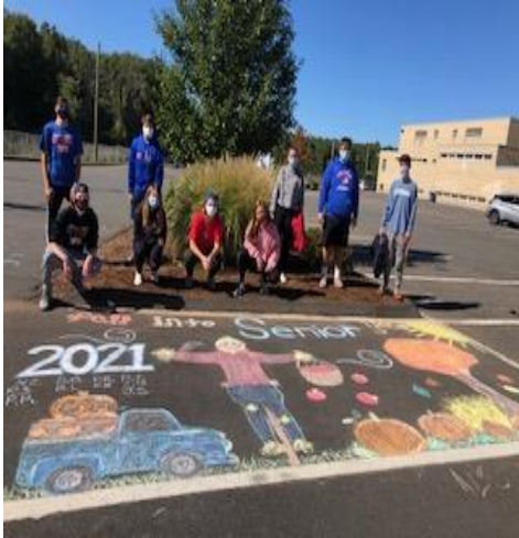
Class of 2021