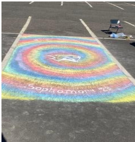
Class of 2023