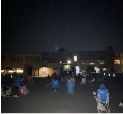
Friday Night at the Movies

Scenes from Welcome Home Weekend ... thanks for your participation and AMAZING talent and school spirit!