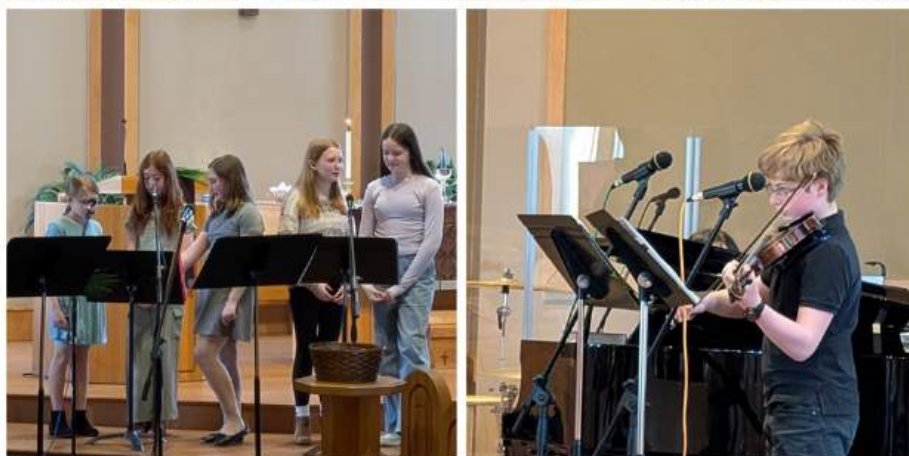
Special Music: Praise Band, Adult Choir, Youth Choir, and a violin solo!