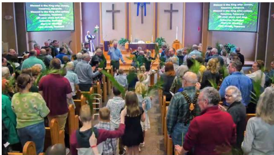
Hosanna Processional by our Light of Christ kids