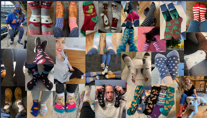
Sock Day ALS Association Greater NY

Here are the theme days and charities for the past four weeks.