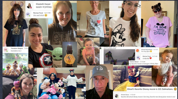
Disney Day St. Jude Children's Research Hospital