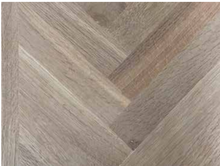
A closeup of the recently laid hardwood floor on the third floor. The hardwood was donated by Allegheny Mountain Hardwood Flooring.

Monday—Closed Tuesday—6-8 p.m. Wednesday—Closed Thursday—6- 8 p.m. Friday—10 a.m.-8 p.m. Saturday—10 a.m.-6 p.m. Sunday—10- a.m.-6 p.m.