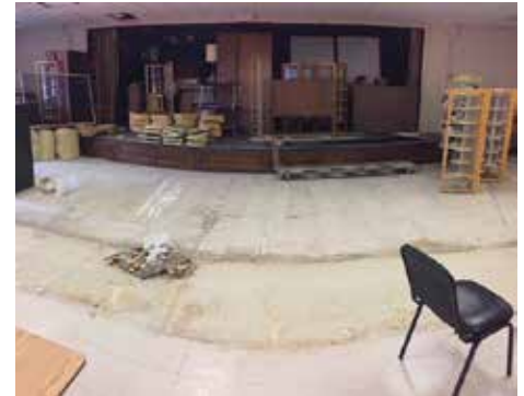
The front of the stage on the third floor of the Borough Building was recently exposed after years of being covered.

The new location is the Penn Ave. Parklet and nearby parking lots. Planning is in the early stages and detail will be out in June.