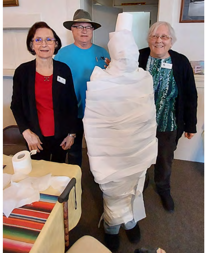
The Mummy Contest (Winners above) ↑