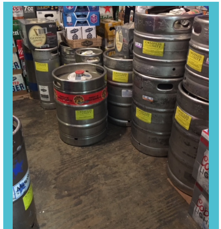
Sticker Shock Stickers on beer kegs at Dave's Bellport Cold Beer & Soda, located at 417 Station Road, Bellport