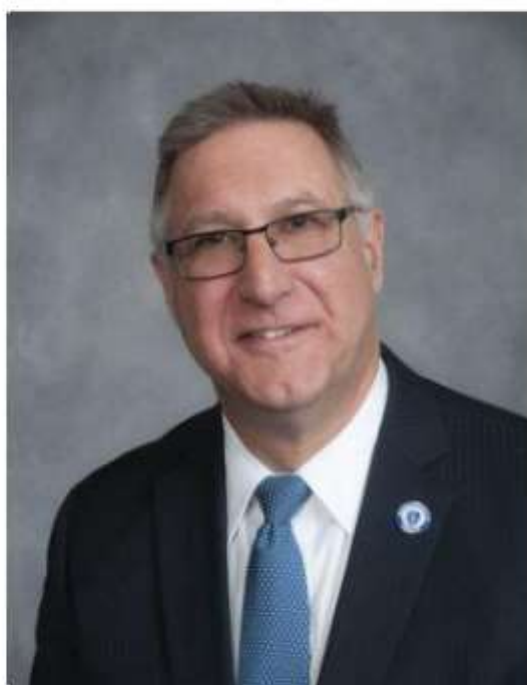
Senator Michael J. Rodrigues Massachusetts Senate Committee on Ways and Means

All the Best to the Westport River Watershed Alliance "Experience WOW! The Wonders of the Watershed"