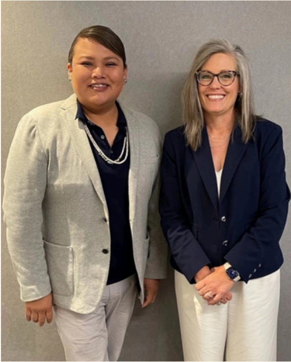
NNWO Deputy Executive Director (left) with Governor Hobbs (right)

NNWO staff attended a roundtable hosted by Arizona Governor Katie Hobbs. The gathering brought together tribal leaders, tribal representatives, and state officials to discuss priorities and challenges facing Indigenous communities across Arizona. The Governor emphasized the importance of government-to-government engagement with tribes and said she would support helpful federal legislation for tribes.