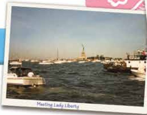
Meeting Lady Liberty