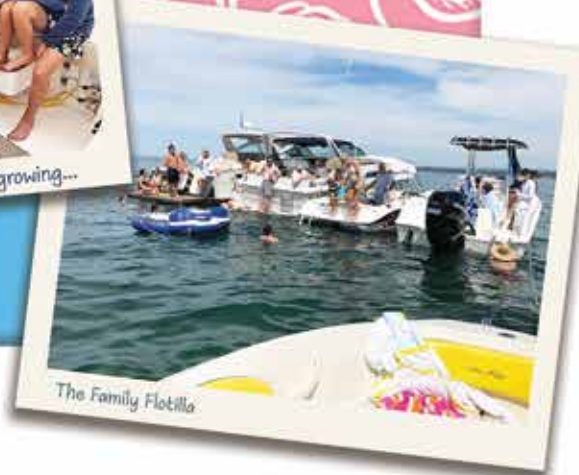
The Family Flotilla