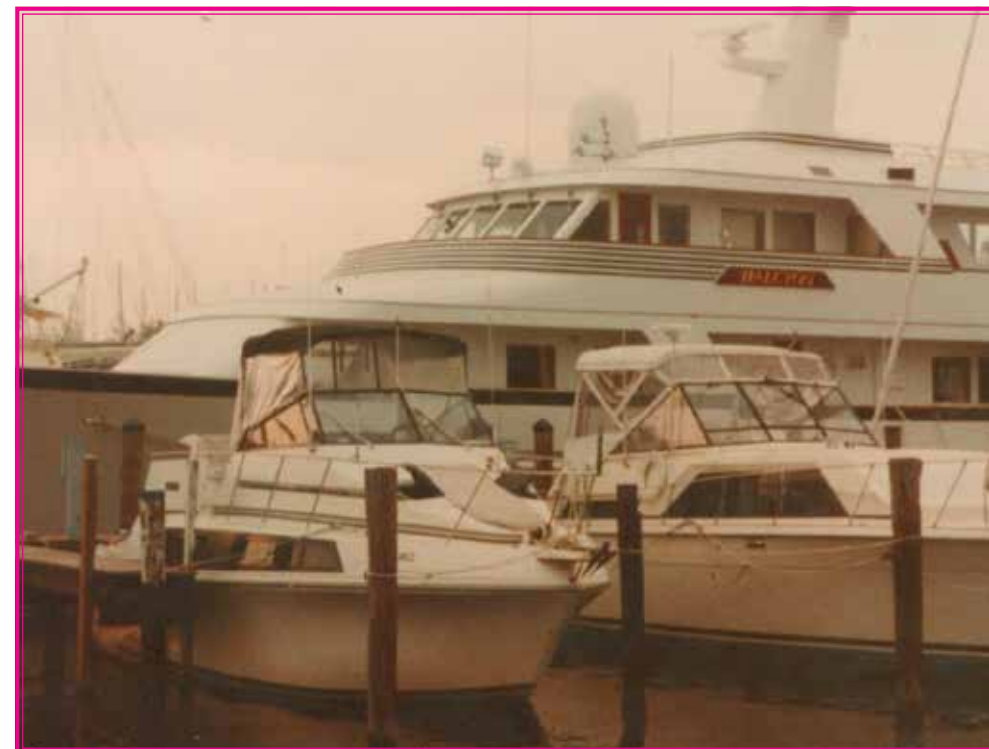
"Big Boy" wasn't an apt name when traveling through the Intracoastal Waterway and mooring on Captiva Island, FL. (It's the small boat on the lower left).

One of their first trips was to the Thousand Islands, they teamed up with the Fred Curze family and their family crew of four to tour the islands, swim in the pools, fish and just have fun! Big Boy also cruised to Georgian Bay and spent many Labor Day weekends partying on Seagull Point long before it became a sanctuary.