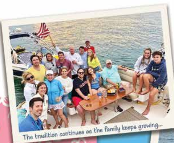
The tradition continues as the family keeps growing...

If These Docks Could Talk, they would say; "The More We Get Together the Happier We Will Be."